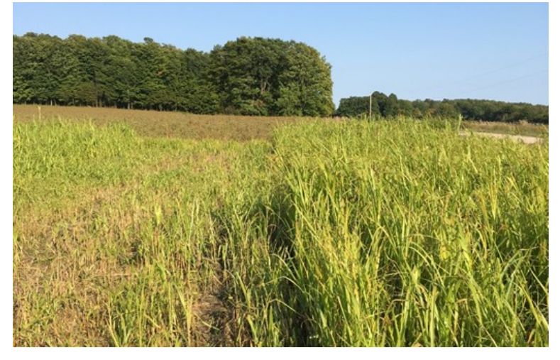
Figure 2. Mowed treatment regrowth (left side) vs growth of unmown pearl millet plot.

Figure 1. (Above) Quadrate used to take biomass samples and estimate plant population. Erosion from excessive rain is also captured, possibly complicating establishment.