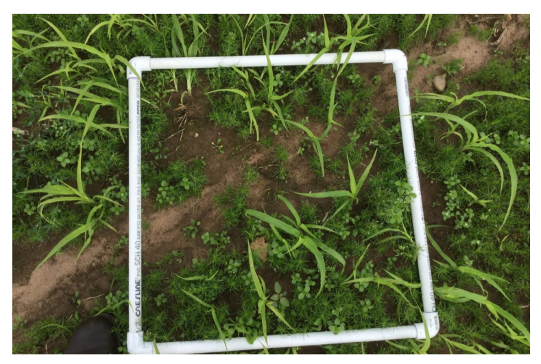
Figure 1. (Above) Quadrate used to take biomass samples and estimate plant population. Erosion from excessive rain is also captured, possibly complicating establishment.

*1971-1994; available at MI State Climatologist's Office website, Escanaba station (<u>https://climate.geo.msu.edu/</u> <u>climate_mi/stations/2626/</u>)